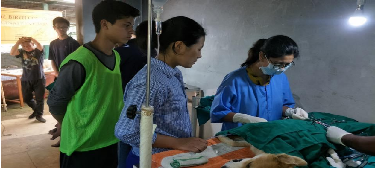
Animal Birth Control (ABC ) and Anti Rabies Camp at Suja