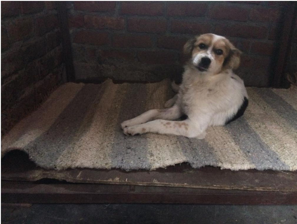
A happy face on Scarlet's face while sitting on the warm blanket