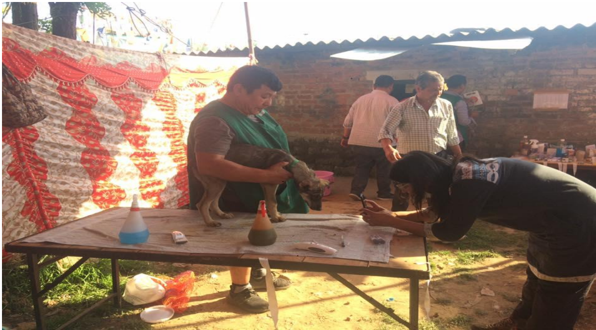
Animal Birth Control (ABC) and Anti Rabies Camp at Bir