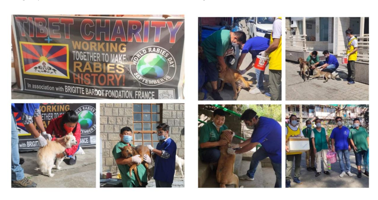
Tibet Charity House

Therefore, we have vaccinated 968 dogs in 10 days of Mass Anti Rabies Vaccination Program. Here are the glimpses of our Mass Anti Rabies Vaccination Program.