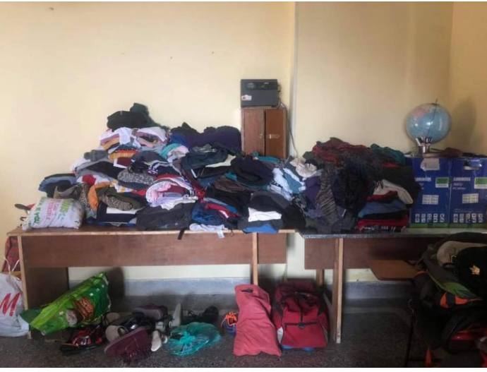
On 15<sup>th</sup> Aug 2020, we went back to the slum village to donate clothes and new shoes to 85 slum children. We also distributed clothes to 50 families in the slum village. We further decided and distributed winter clothes and winter blankets too before the winter started.